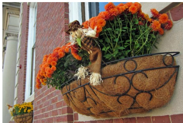
Thank you to businesses that have planted fall flower displays. Here's what the YMCA did!

All businesses located in the Beverly Main Streets district are eligible to win. Decorations should be visible from the street or sidewalk. We can't wait to see the winter season and holiday theme window decorations you are going to put up – just in time for the busy holiday shopping season!